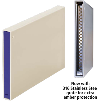
Now with 316 Stainless Steel grate for extra ember protection